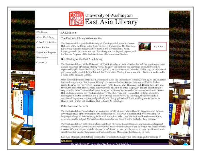
New EAL site homepage

Recently, the EAL has become an official UW