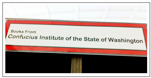
Confucius Institute bookshelf

especially its UW programs. In the EAL readingroom, some display shelving has been arranged for new collections on Chinese language and culture provided by the Confucius Institute. We aspire to play an active and contributing role not only in providing library collections and services but also in organizing cultural activities in support of the curriculum of the CIWA.