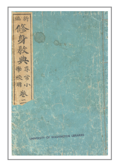
Textbook of Moral Education (Elementary). Published in 1900.

The Japanese pre-catalogue collections include at least 7,000 items. Most of them were published between 1901 and 1949. The majority are in the social sciences, with good coverage of topics such as Japanese colonial policy, nationalism, militarism, communism/anti-communism, the war-time economic conditions in Japan, and memoirs of wars. There are also works on modern Buddhism and Christianity. Other major collections are Japanese art catalogues, literature, and government-approved textbooks published before World War II. In addition, there are more than 150 books with traditional binding, maps, and manuscripts. These items include premodern materials published before 1868.