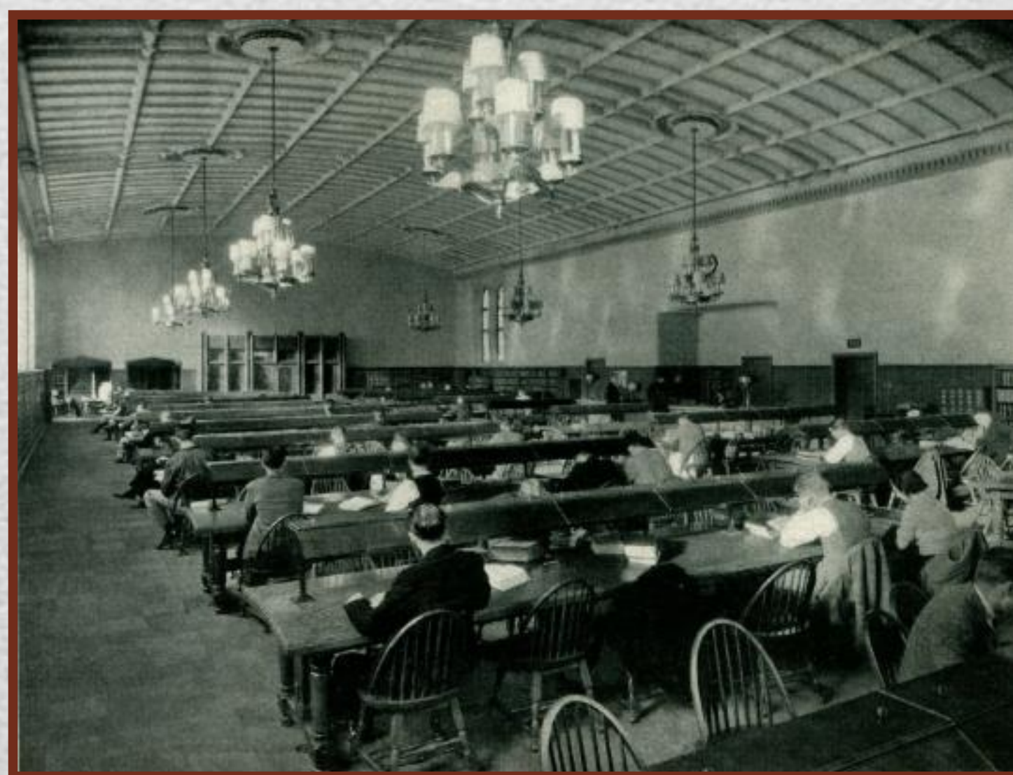
Main reading room in the law school's library, ca. 1933.

Property of MSCUA, University of Washington Libraries. Photo Coll 700