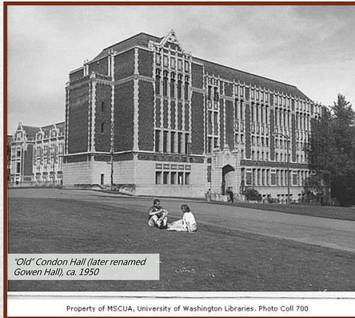
"Old" Condon Hall (later renamed Gowen Hall), ca. 1950