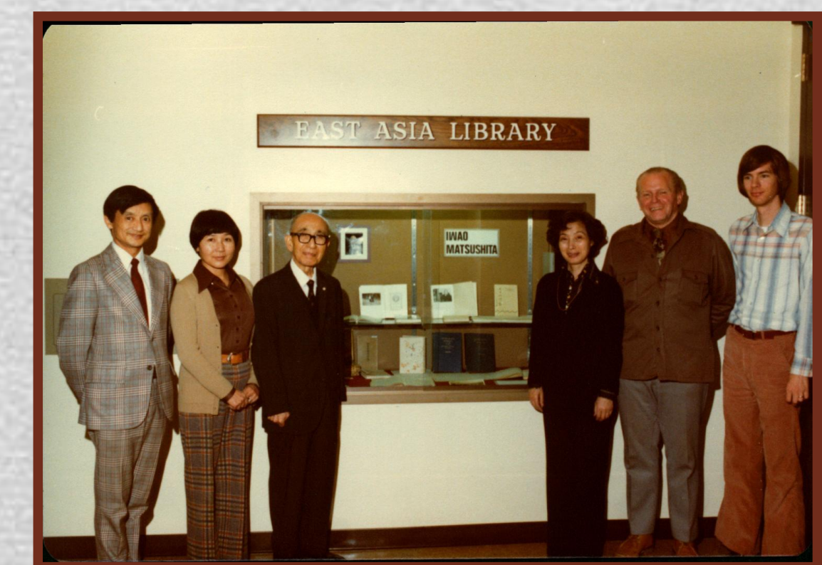
Exhibit box at the EAL entrance, 1976.